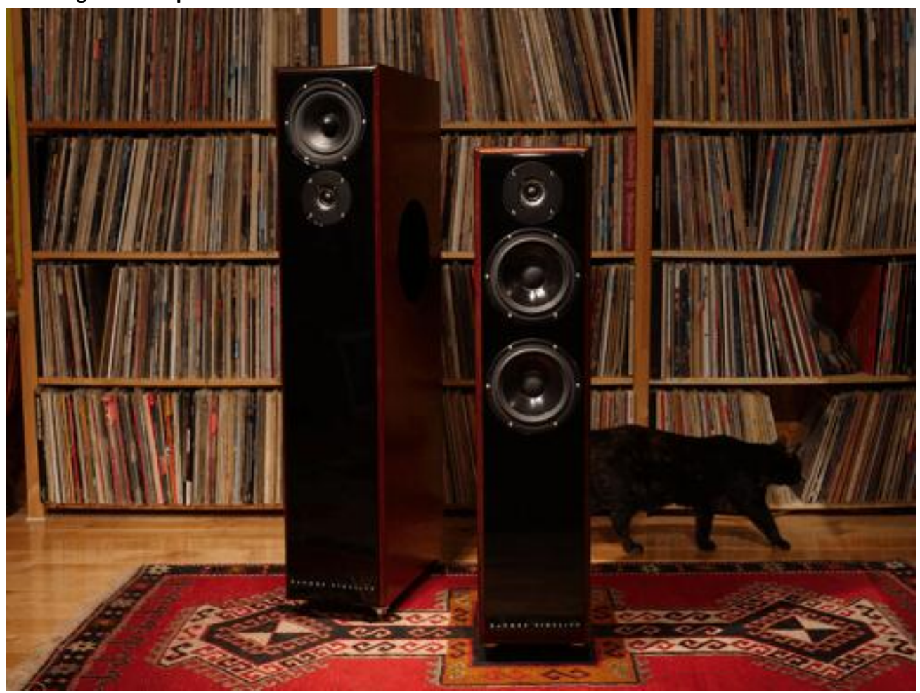
Size comparison of the gibbon X and the Super Nine for scale with Roxy the cat

Overall the sound of this combo had an organic quality that breathed depth and life into the music. The sound was rich, layered and dimensional allowing me to hear real detail that sounded very