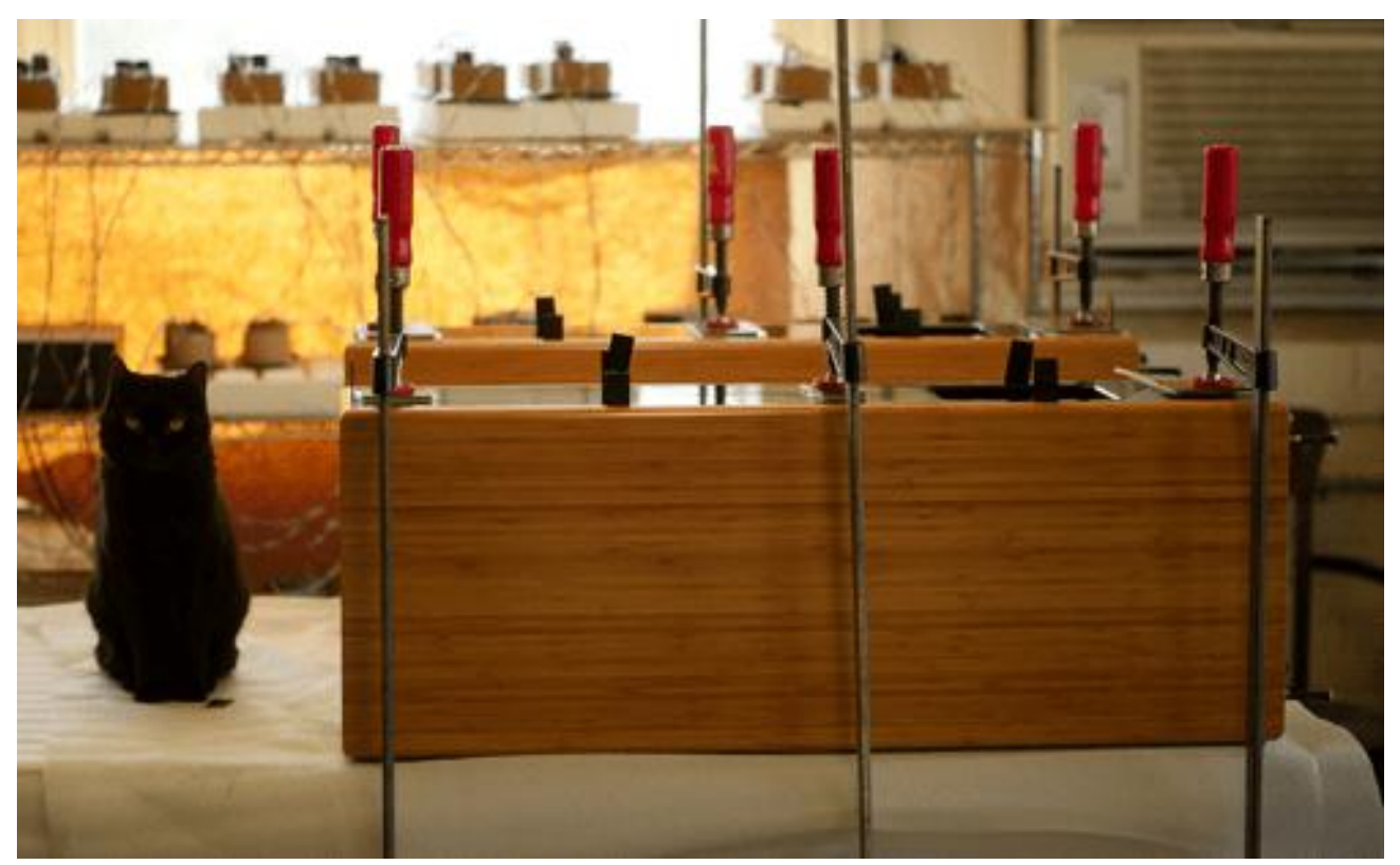
Factory glue-up of a Super Nine speaker with Lulu Bear, one of the DeVore Fidelity cats supervising.

One of the first things that I noticed about these speakers is that they are a bit more modern sounding than my Teresonic Ingenium XRs or the DeVore Orangutan speakers. By this I mean the tonal balance is more accurate and refined combined with pure beauty. That said, the detail is exceptional, and they definitely stand on the 'juicy' side and not the 'dry' side of tonal balance.